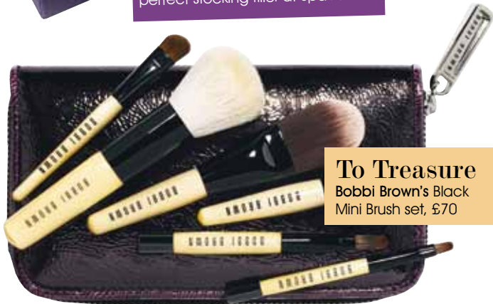
To Treasure Bobbi Brown's Black Mini Brush set, £70

LIGHT UP Indulge your sensual side with a Lux Natural Massage Candle from Julie Carter. Simply light the candle, and when it heats up use the shea butter wax for a relaxing massage in a beautifully fragranced room. Why not buy it for your partner, as a not-so-subtle hint? Choose from Aphrodisiac, Energy, Relax or Harmony, Julie Carter prices from £9.95 – £37 0191 281 6333