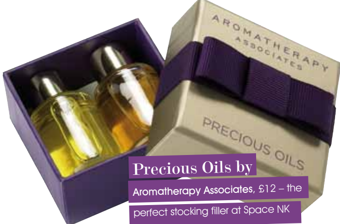
Precious Oils by Aromatherapy Associates, £12 – the perfect stocking filler at Space NK