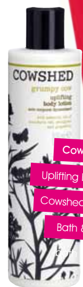
Cowshed Grumpy Cow Uplifting Body Lotion, £16 and Cowshed Horny Cow Seductive Bath & Massage Oil, £22